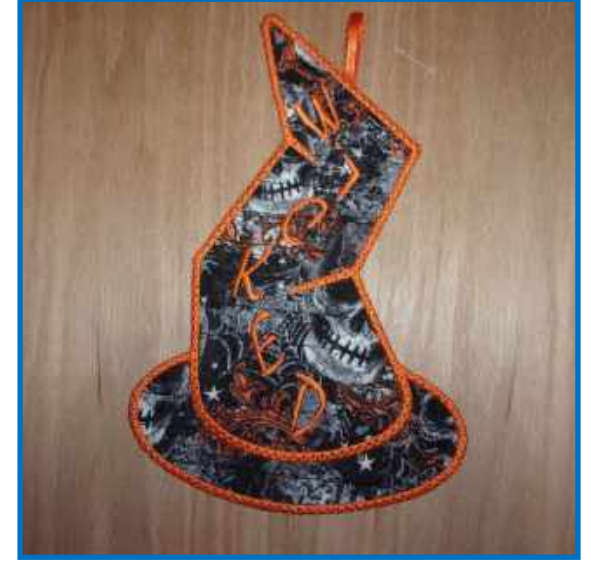
STITCHED BY SANDY HOLMAN