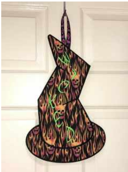
STITCHED BY FLO CAMPBELL