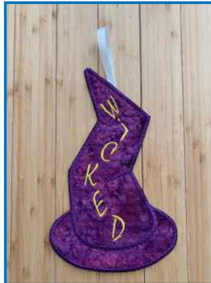
STITCHED BY Beverly Lemon