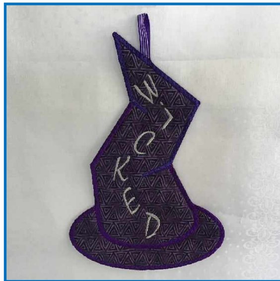
STITCHED BY DARINA KATHLEEN FOOTS