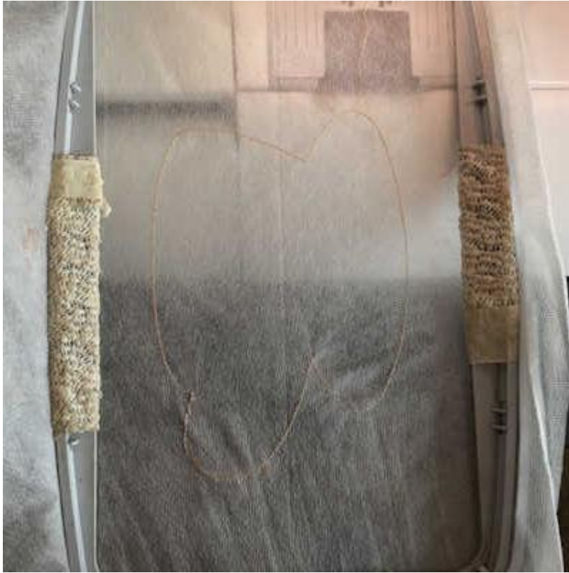
Stitch Color 1 – the outline of the Cup