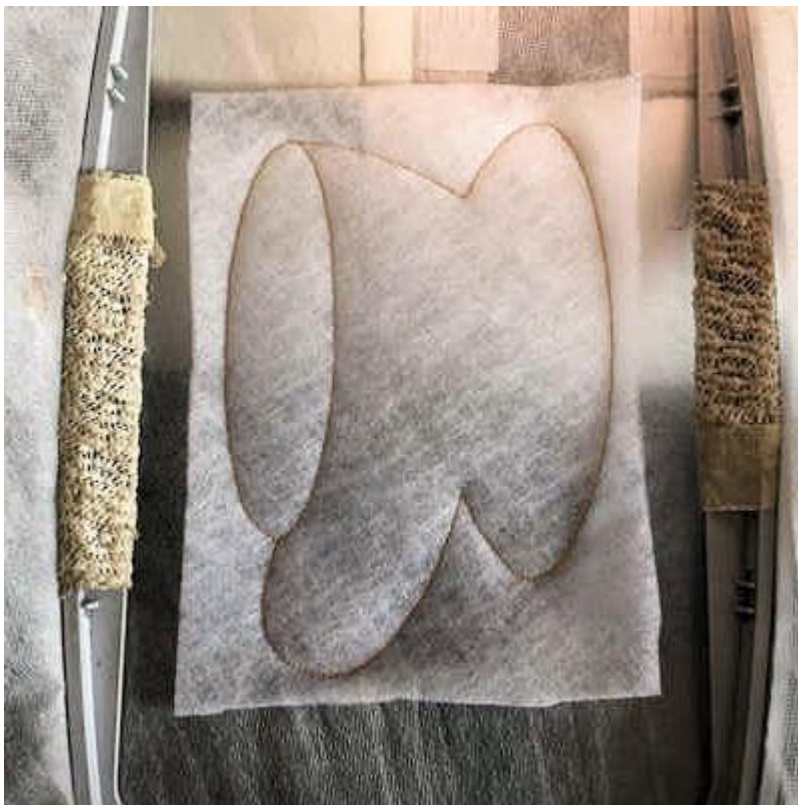
Place pellaon/thin batting over the Guideline and Stitch Color 2 to attach